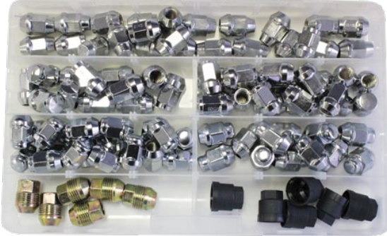
Asst # 0134

100 Piece Assortment - contains 6 of the most popular chrome acorn & external thread wheel nuts