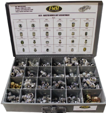
Asst # 0171

320 Piece Wheel Nut Assortment - 24 part numbers with coverage for many popular vehicles